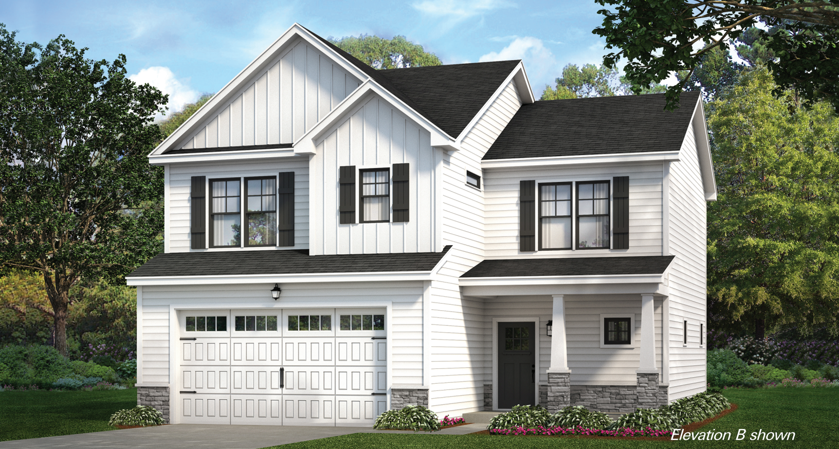
Elevation B shown